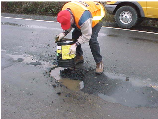
A maintenance worker fills a pothole on Century Drive in Albany with TAG 8000 mix

Both manufactured and natural potholes were monitored for a period of 24 months. The relative height of the patch to the surrounding pavement and the condition of the material filling the hole were measured. Dishing and crowning were used as indicators of patch performance, as they can affect pavement smoothness. Additionally, visual inspections were made to identify excessive pavement distress such as stripping or raveling of the patching material.