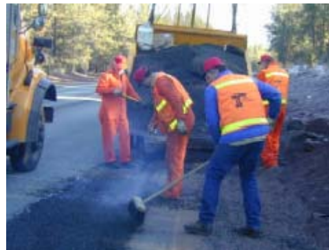
Bend maintenance crew repairs potholes

Looking for the ideal material to patch potholes? Faced with the wide variety of choices, which product is best suited for a particular application? Many vendors claim their products are the “perfect” fix for potholes in asphalt concrete pavement. But would any of these products meet the Oregon Department of Transportation’s (ODOT) need for cost effective and reliable pothole patching materials (PPMs) that perform in a variety of environmental conditions? In the winter of 2000, ODOT Research worked with highway maintenance personnel to find out.