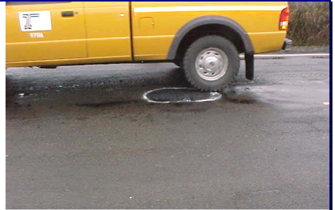
A pickup truck drives over the filled pothole for compaction of the mix

Manufactured holes were constructed with a jackhammer at Century Drive in Albany and at Wallace Road near Salem (Oregon Route 221, Salem-Dayton Highway). In addition, several natural potholes were filled at Century Drive in Albany, near Ona Beach Park south of Newport (U.S. Route 101, Oregon Coast Highway), and between Lyons and Scio on the Albany-Lyons Highway (Oregon Route 226).